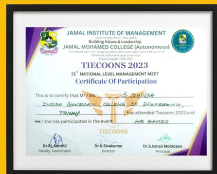
Students of II Year MBA participated in the 21 st National Level Management Meet - TIECOONS 2023 held at Jamal Mohamed College (Autonomous).