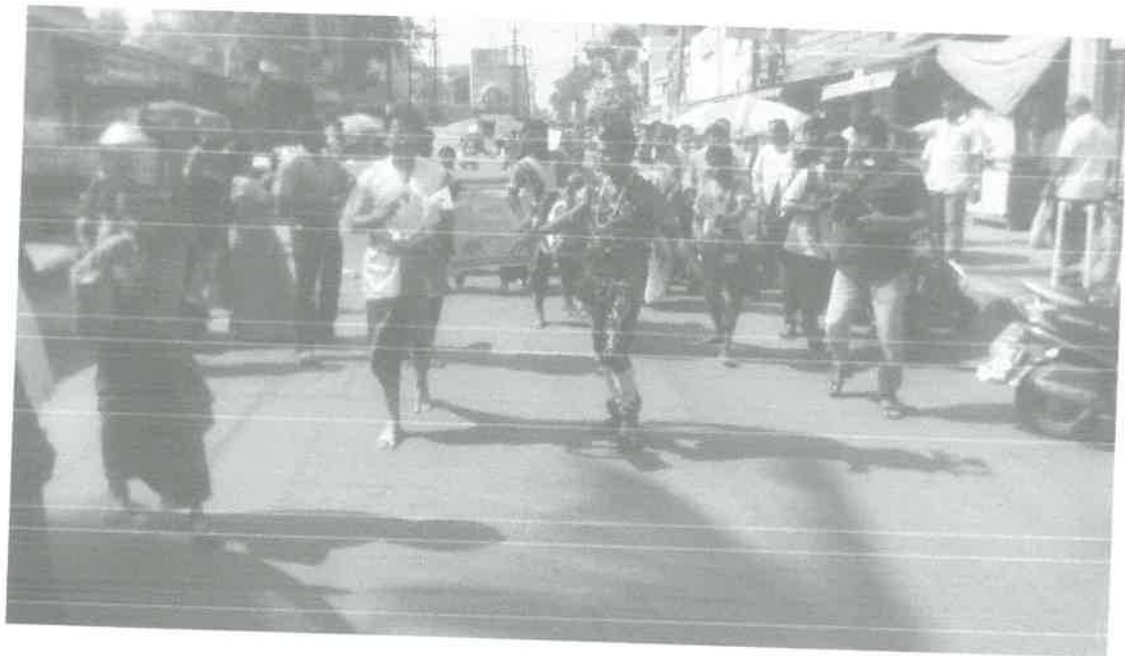
Voting Awareness Program on 25.01.2020