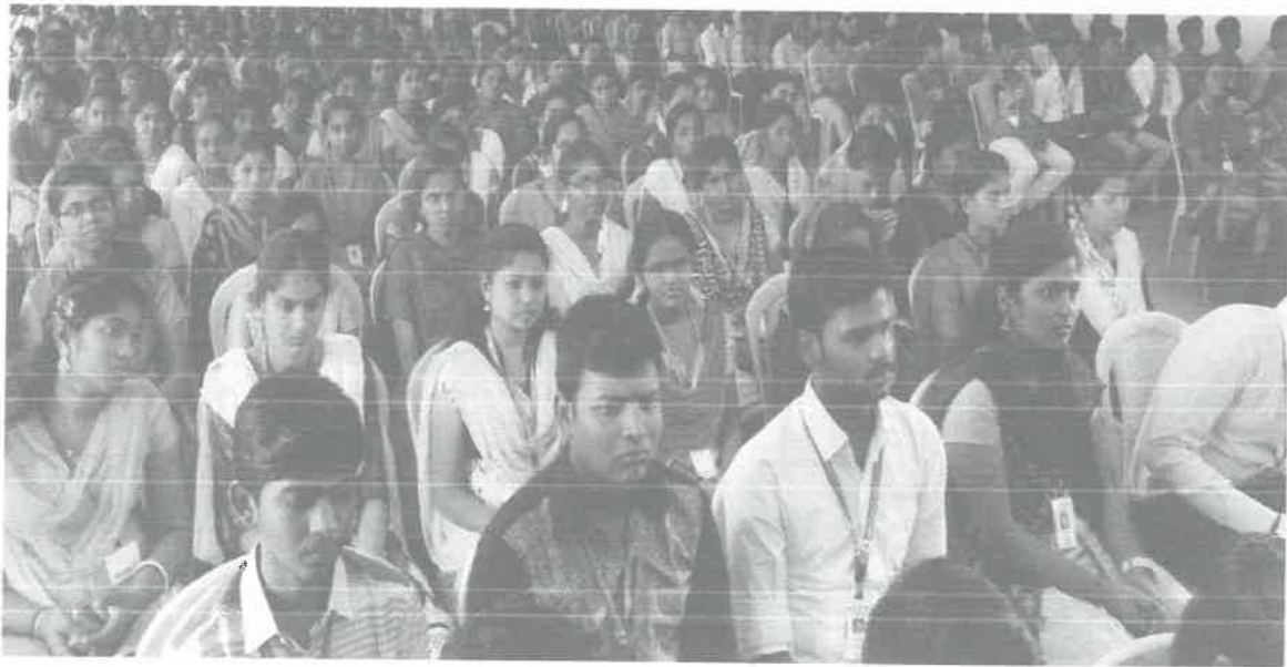
“Rights to Equality” on 26.11.2019