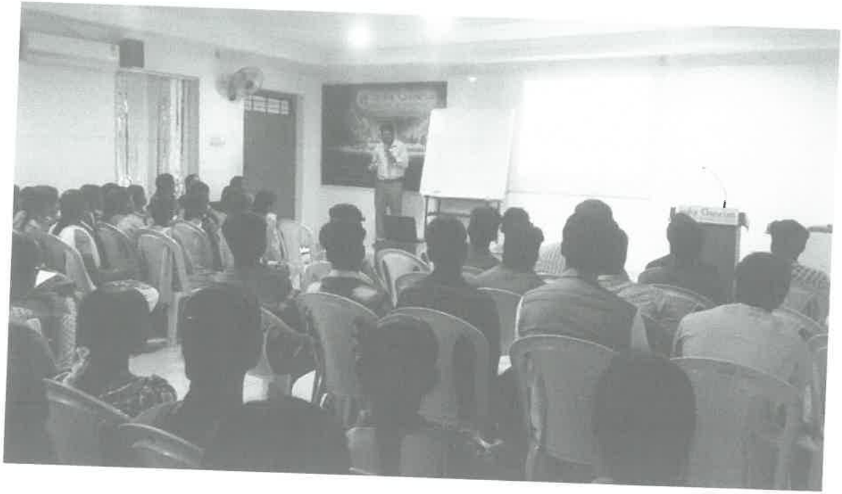
Voting Awareness Program on 25.01.2021

A handwritten signature in green ink, consisting of a stylized 'G' followed by a dot and a horizontal line.